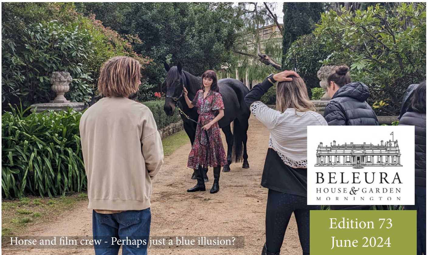
Horse and film crew - Perhaps just a blue illusion?