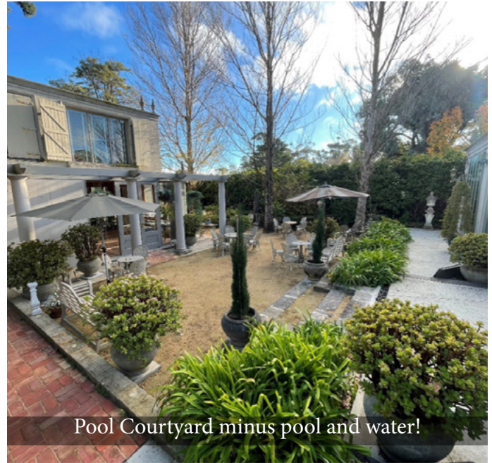
Pool Courtyard minus pool and water!