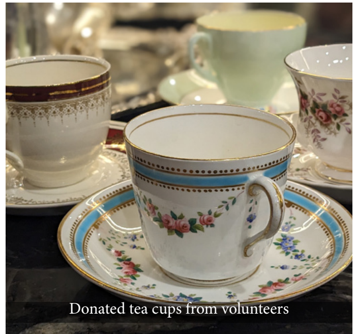
Donated tea cups from volunteers

He left his signature hidden in the embossed band on a copper downpipe that runs into a cistern behind the Summerhouse.