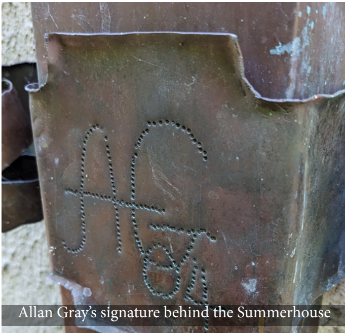
Allan Gray's signature behind the Summerhouse