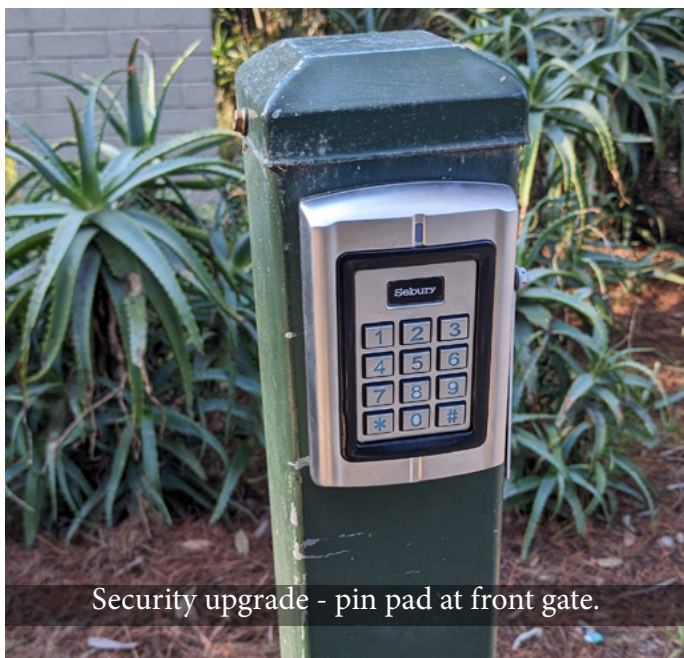
Security upgrade - pin pad at front gate.